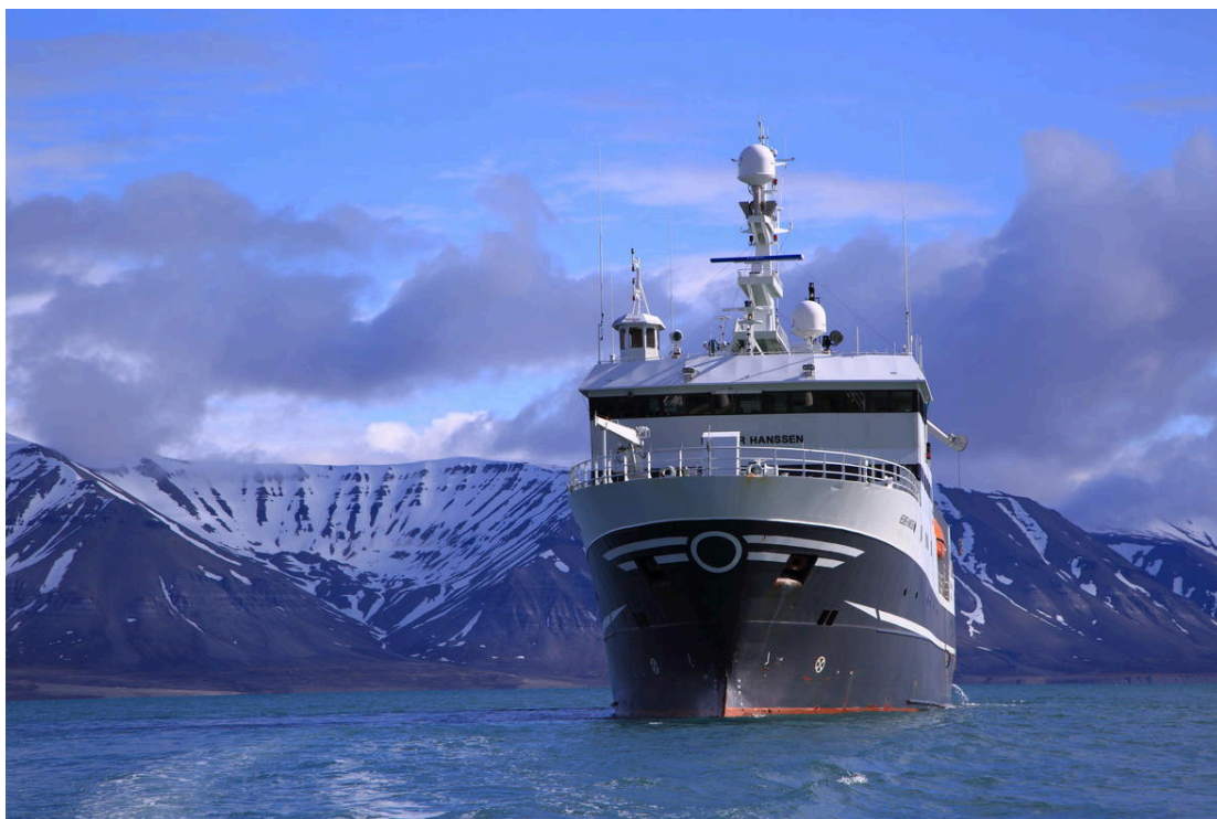
Research vessel Helmer Hanssen of UiT – The Arctic University of Norway offshore of the Svalbard Islands.

Most previous studies have focused only on the sea-air flux of methane overlying seafloor seep sites and have not accounted for the drawdown of carbon dioxide that could offset some of the atmospheric warming potential of the methane.